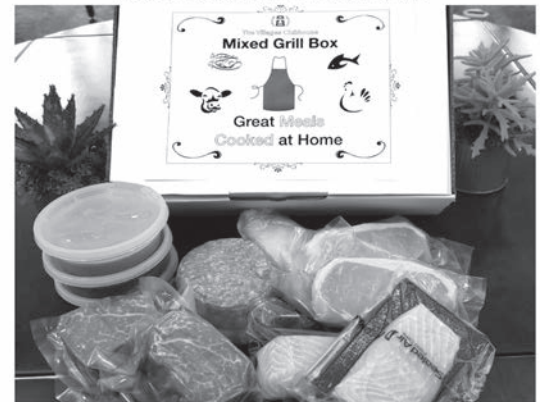
MEAT, POULTRY AND SEAFOOD ARE CRYOVAC SEALED.

2 EA, 6 oz. USDA CHOICE, HAND SELECTED FILET MIGNON 2 EA, 6 oz. USDA BONELESS AND SKINLESS CHICKEN BREAST 2 EA, 6 oz. NORTH ATLANTIC SALMON FILETS 2 EA, 6 oz. USDA CENTER CUT PORK CHOPS 1 LB. USDA CHOICE GRASS-FED BURGER PATTIES (3 EACH) CHEF RALPH'S BBQ SAUCE, PEPPERCORN SAUCE AND COUNTRY GRAVY